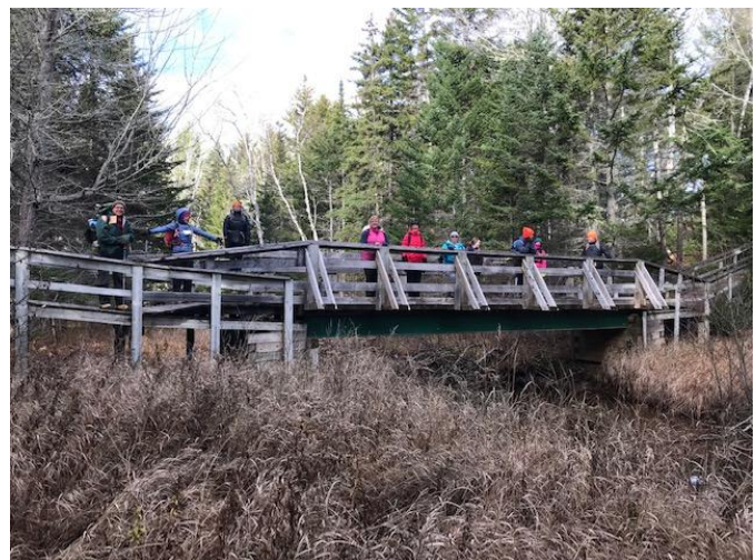
Participants of a Field Leader - Hiking course in Tidnish Bridge in November 2020 (photo credit: Brett Crossman).